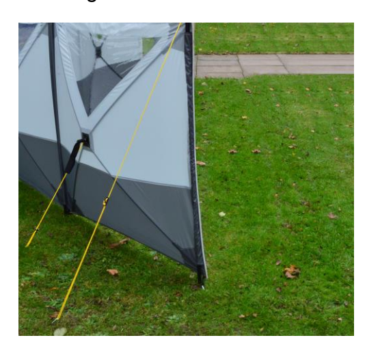
Repeat for all 4 panels.

It is recommended each peg is fully driven into the ground at an angle of 45 degrees away from the pegging point. Tension each guy rope using the guy adjusters: